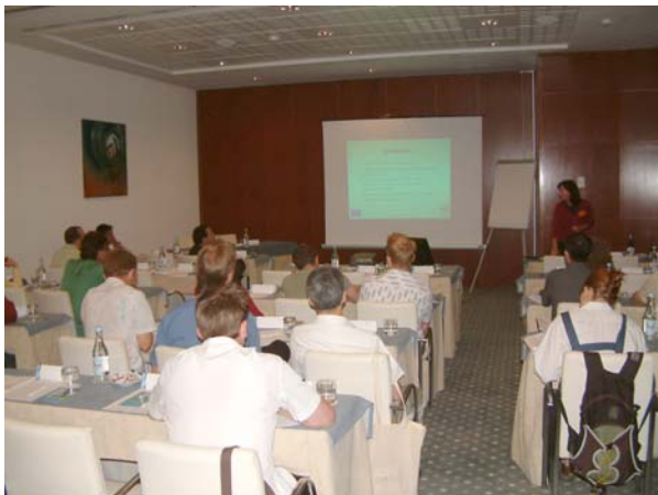
Technical concurrent session