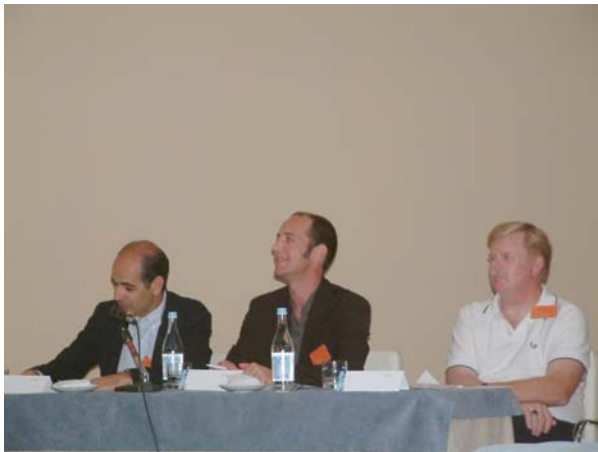
Presidency table in the opening session

The biannual meetings above mentioned have been held in diverse locations since 1994, being hosted in Portugal for the first time. Below we present some photos that illustrate different moments of the event.