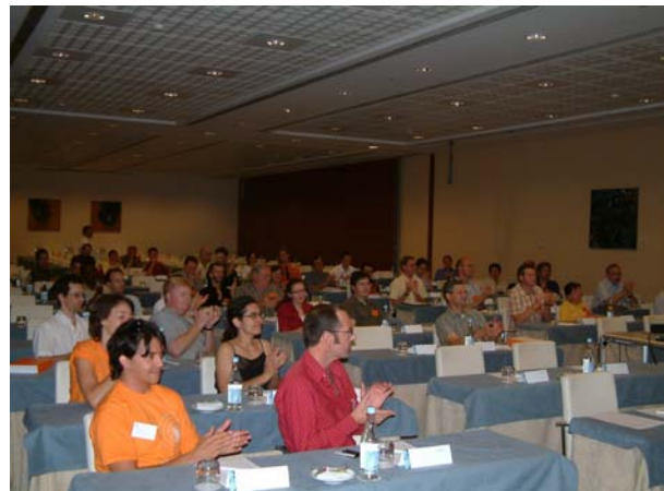
Audience in one of the plenary lectures