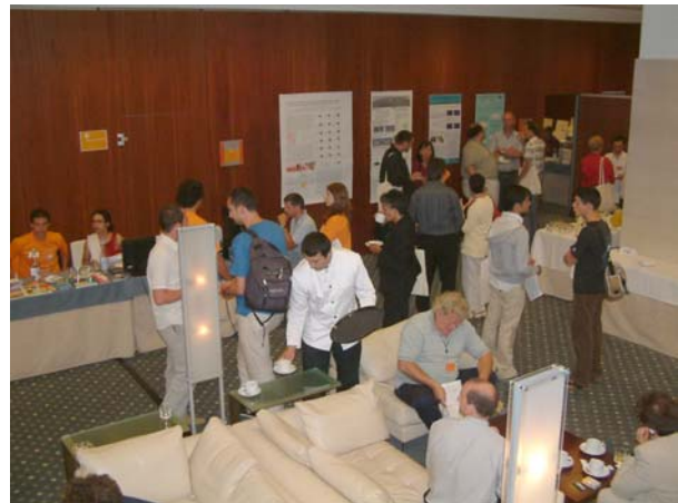
Registration desk and poster exhibition